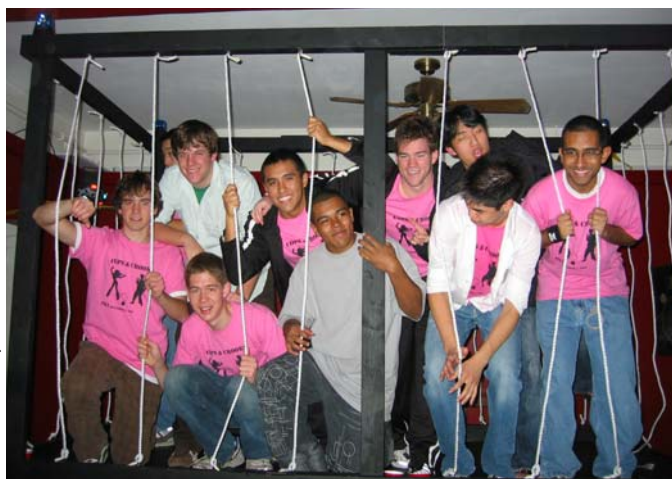
The former pledges pose before their Cops and Crooks Party on top of the pool table cover, which they turned into a mock jail cell.