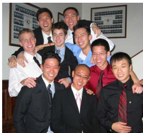
The studly senior class poses for a group picture during the semiformal.